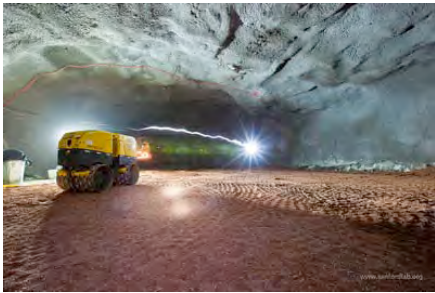
Figure 3: Transition Cavern of Davis Campus 4850 Level, seen here during outfitting, excavated in 2010. Now home to the MAJORANA DEMONSTRATOR experiment

The “Deep Photography” part of the exhibit chronicles the transformation of the Homestake Mine into the Sanford Underground Research Facility, and is part of the exhibit. Photography (examples shown in Figures 2 and 3) is by Steve Babbitt, professor of photography at BHSU, and Matt Kapust, SURF multimedia specialist.